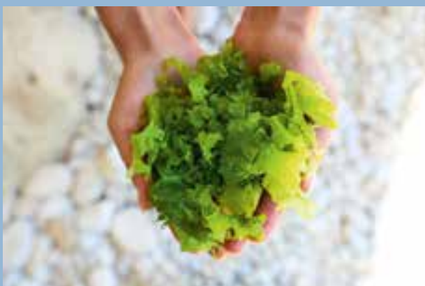
Fresh green seaweed contains antioxidants and is used in many vegan and vegetarian recipes, as well as in Japanese cookery

After a trip to Coromandel back in 2012, I returned to Canberra and registered a business in New Zealand. Then, I developed a couple of products and obtained the certifications I needed to harvest seaweed. At first, I had to manage Premium Seas remotely from Australia and fly over just for the seaweed harvest. Two years ago, I left my job, moved to Coromandel and became a full-time seaweed entrepreneur.