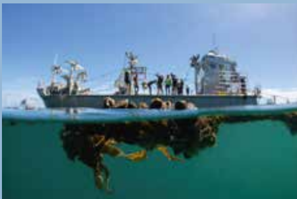
Days at sea feel like days off – the team sometimes see dolphins, whales and penguins